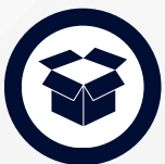
Figure 1 - Imperial Battery's NetSuite Modules

Whether purchasing batteries or transacting in the trade-in and refund program, customers have all the options they need.