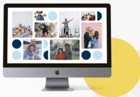
Automating their online platform enables a smooth experience for parents and educators in the Well Trained Mind Community.

Extracting value from their "single source of truth" allows their team to focus their efforts on expansion and future organizational goals.